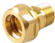
Model SKS 2 01 connector with male thread