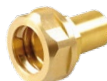
Model SKS 2 550 connector for copper pipes