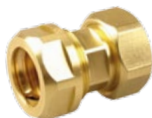
Model SKS 2 500 connector for copper pipes