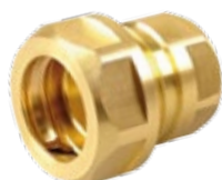
Model SKS 2 110 connector with female thread