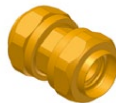
model SKS 1 05 coupling