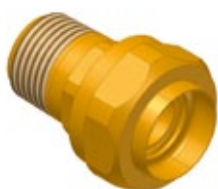
model SKS 1 01 connector with male thread