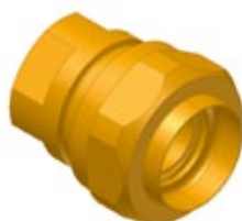
model SKS 1 110 connector with female thread