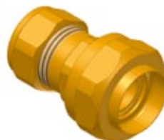
model SKS 1 500 connector for copper pipes